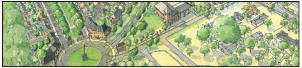
A rendering of the plan for Museum Drive

Mission: To make The Village of Spring Hill a neighborhood center by improving the pedestrian, aesthetic and commercial amenities of the area