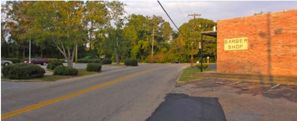
Bit & Spur approaching Old Shell: Before and After*