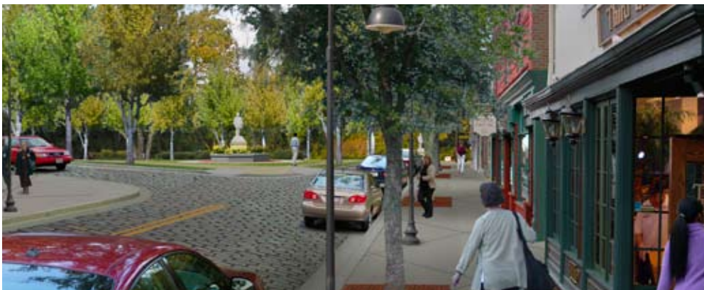
Old Shell approaching McGregor: Before and After*